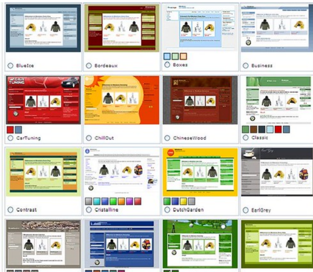
Unduh 8 Launcher Drain